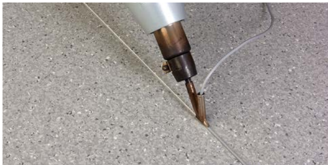
Figure 2 Applying the weld