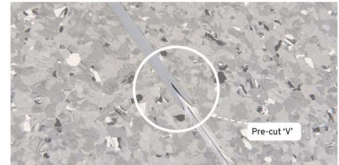
Figure 3 Weld joins

the centre. At this stage, pull the gun away from the groove and cut off the welding rod. Using a trimming tool and guide trim off the excess welding rod. Commence welding as before, from the opposite end of the room. Run out the weld into the pre-cut 'V' (Fig 3) and cut off the excess welding rod.