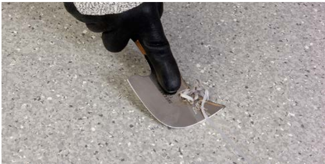
Figure 5a Final trim after the weld has cooled (Spatula Trimming Knife)