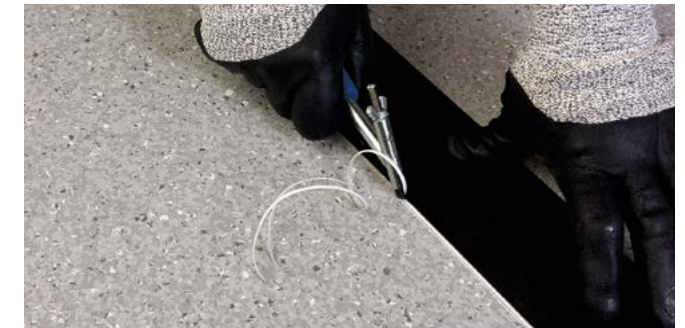
Figure 1 Grooving the seam

The groove on foam backed ranges such as Acoustic and Sports flooring should only be cut in the vinyl wear layer; NOT cut through to the PVC foam backing.