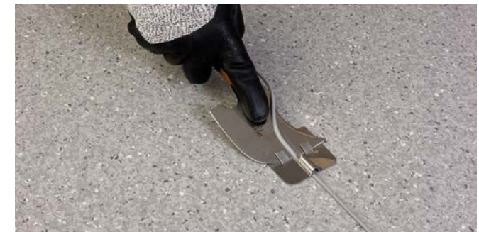
Figure 4a Trimming off the weld top layer (Spatula Trimming Knife)

Welding Techniques are covered on the 4 day Polyflor Sheet Vinyl Course