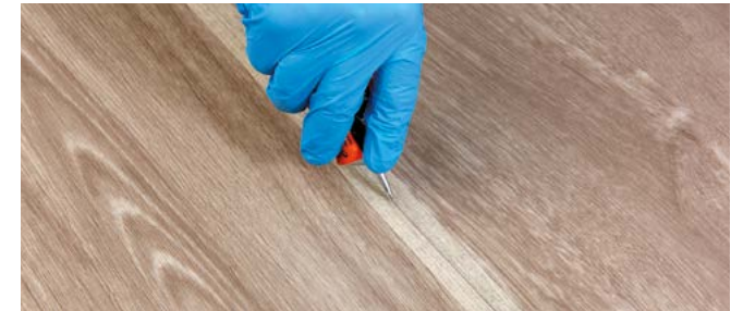
Figure 7 Cold welding