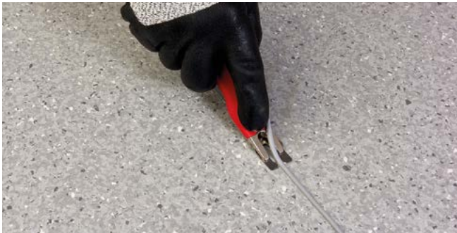
Figure 4b Trimming off the weld top layer (Mozart Trimming Tool)

Polyflor foam backed vinyl sheet flooring is liable to compression and sometimes, even after the final trim, the weld is proud of the floor. In this case using a Mozart trimming tool in preference to a traditional spatula is advisable.