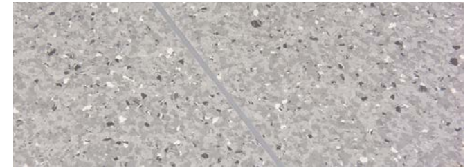
Figure 6 Final weld

Should a glazed finish be required this can be achieved with the nozzle attachment removed but still on the same heat setting; play the standard gun nozzle over the trimmed weld. Repeat over the whole length of the weld, keeping the gun moving constantly to prevent burning.